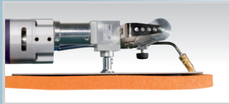
Light and flat construction (finishing head is only 98 mm)

Carry case, water feed system, Backing plate, PRCD cable device, 2 finishing sponges, Adapter M8/M14